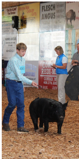
Find more Marias Fair pictures on Facebook at MSU Extension - Glacier County and Marias Fair 4-H